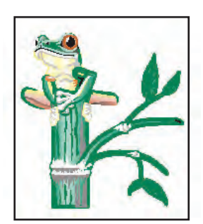
.gif @ 400%

Files obtained from the internet (.jpg or .gif) or artwork created in MS Office applications (Word, PowerPoint, Publisher, Excel, etc.) are not suitable for high quality output, and require additional hourly charges. Artwork should be created in a design program at 50-100% of actual size. If you have very large files please contact us for options. To avoid additional costs, please send files using the guidelines below.