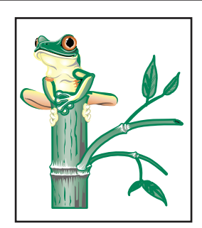
.ai / .eps vector @ 400%